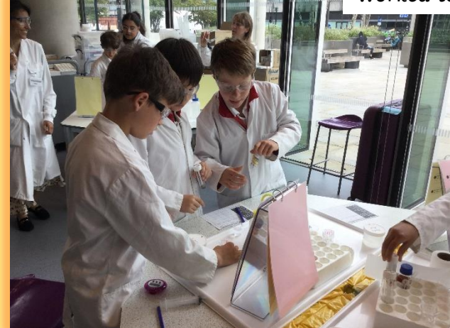
During the afternoon, we learnt about motors and worked to create circuits with a variety of components.