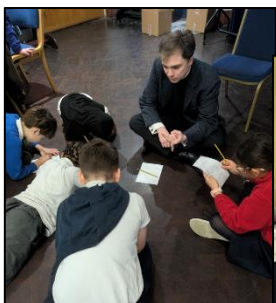
Y5 group meeting faith leaders at the Camden interfaith event