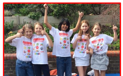
World Happiness Day!

Wednesday 2 nd September – new Years 1-6 back to school