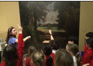
Y4 and Y5 at Tate Britain to see the Turner and Constable exhibition