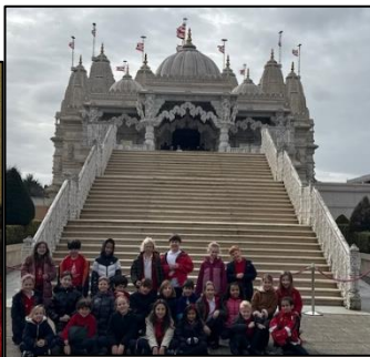
Y4 at the Neasden Hindu Mandir