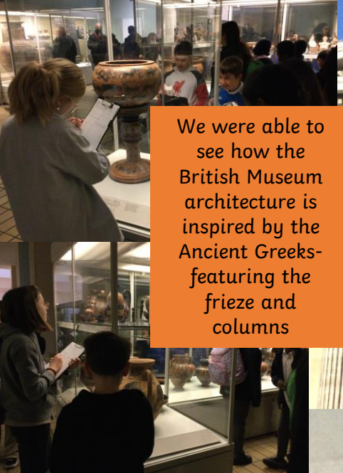
We were able to see how the British Museum architecture is inspired by the Ancient Greeks- featuring the frieze and columns