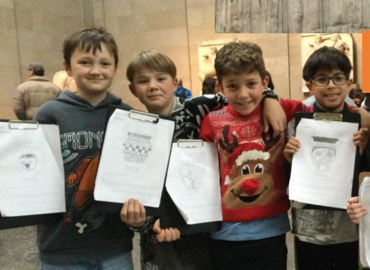
We saw parts of the Parthenon from Ancient Greece