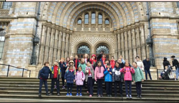
on Earthquakes and Volcanoes and found out all about how they are formed or occur, and what the impact of them on people are. We also learnt about two different types of volcanic eruption – effusive and explosive