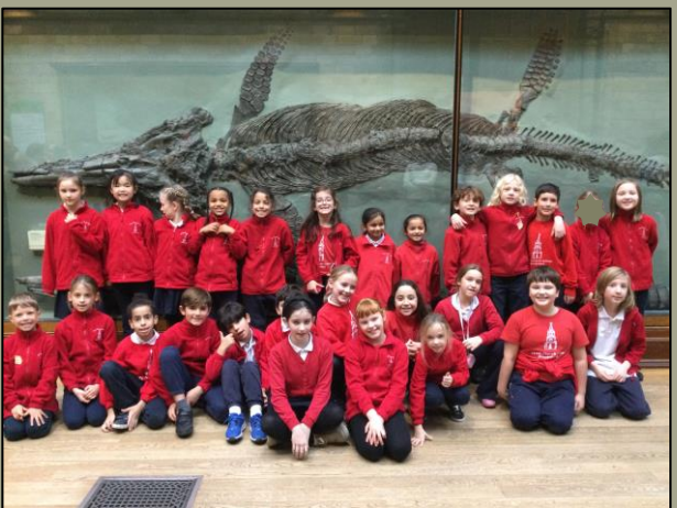
We were very excited to see some of the fossils Mary Anning discovered on the Jurassic Coast.