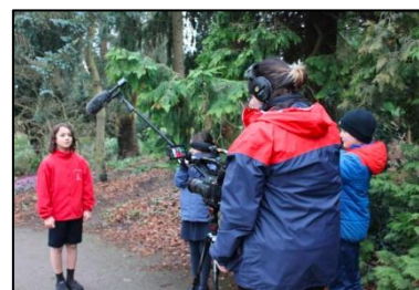
Y5 filming on the Heath