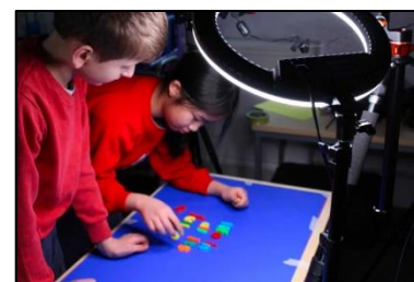
Year 6 stop motion animation