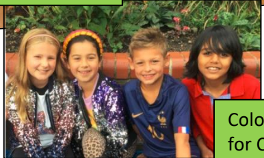
Colours and sparkles for Charlie Day!