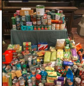
Harvest food donations