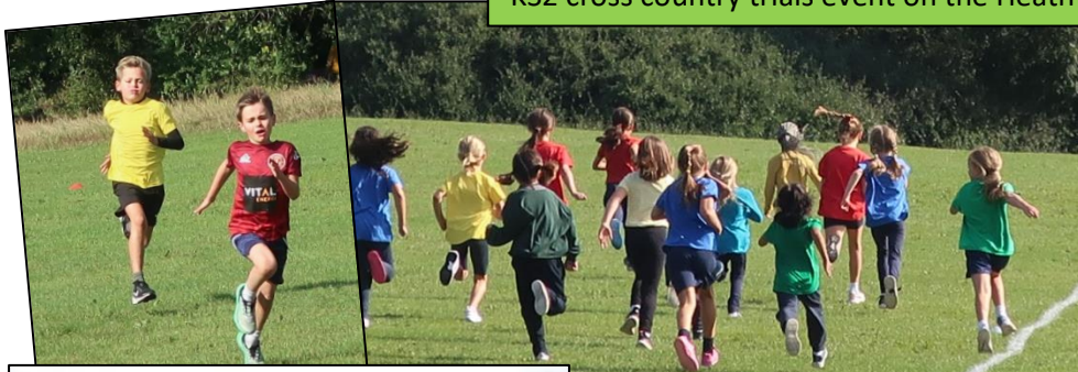
KS2 cross country trials event on the Heath