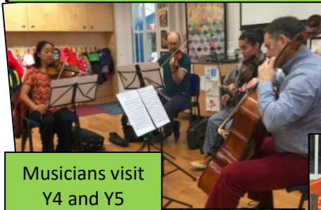
Musicians visit Y4 and Y5