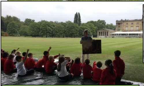
Y5 landscape drawing on the lawn in Buckingham Palace garden

Monday 28 th October to Friday 1 st November – Half term