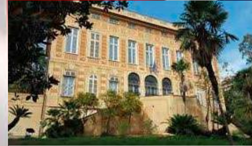
Comprehensive School of Pegli

Year 4 linked up with a school in Pegli, near Genoa in Italy. We wrote booklets all about London and our local area and sent them to the children in the year 5 class there. After this, they sent us brochures about different provinces in Italy. It was so interesting learning all about Italy, and it linked brilliantly to our geography learning on Rome. We also had a visit from a group of pupils and staff from the school who came to see