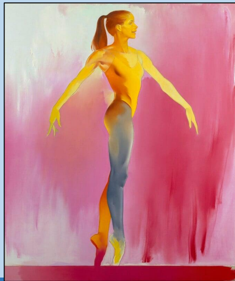
“The famous ballerina because she looked beautiful.”