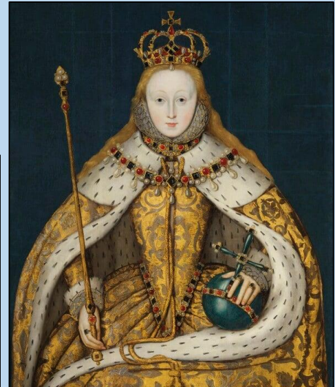
“Queen Elizabeth I because I liked her dress.”