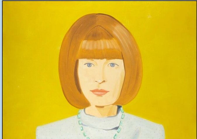
“This one that looked like me!”