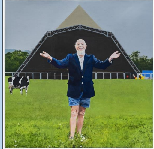
“The farmer with the cow because it was funny.”