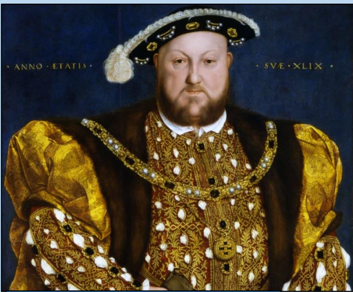
“My favourite portrait was Henry VIII because he had gold on him.”