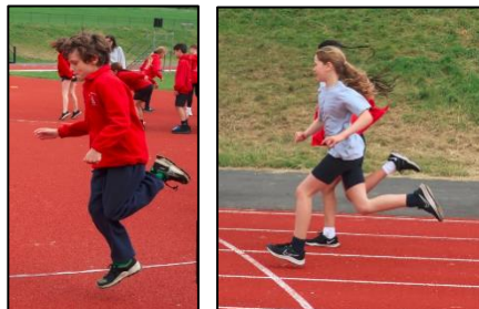
KS2 had a great morning at Parliament Hill track for our trials event for the Y3/4 and Y5/6 Camden athletics tournaments.

All parents and family members are warmly invited to our remaining class assemblies which take place at 10am in the school hall. Friday 7 th June – Year 1 class assembly Wednesday 12 th June – Year 2 class assembly Friday 14 th June – Reception class assembly Friday 28 th June – Year 5 class assembly Friday 12 th July – Year 6 memories and speeches assembly (9.45am start)