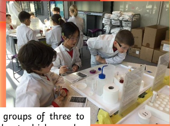
At our stations, we worked in groups of three to test five powders in order to find out which powder was cornflour. Some of the things we tested were the solubility and acidity of each powder.