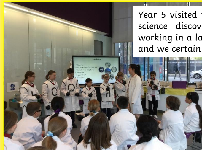
Year 5 visited the Francis Crick Institute for a science discovery day. We spent the day working in a lab wearing lab coats and goggles and we certainly felt like scientists!