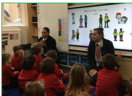
Meeting Police Officers in Reception and finding out how they help to keep us safe.