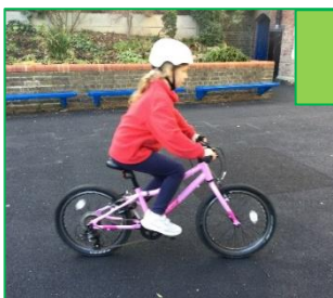
Bike and scooter safety workshops