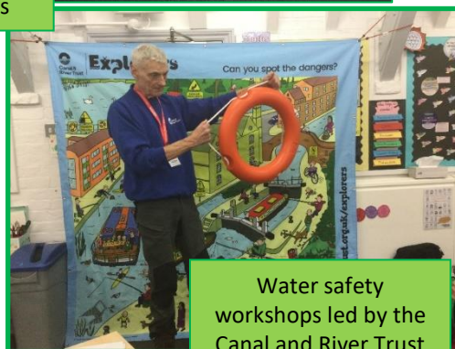
Water safety workshops led by the Canal and River Trust