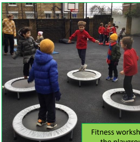
Fitness workshops in the playground