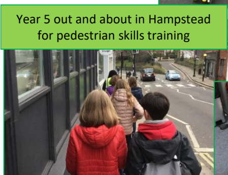
Year 5 out and about in Hampstead for pedestrian skills training