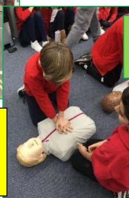
Life-saving First Aid workshops for Year 4 and Year 6