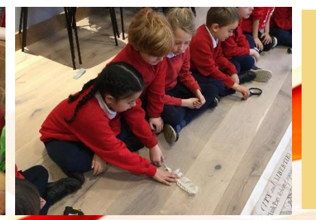
We took part in a workshop where we were able to learn about his life, and how he was able to help rebuild the city.