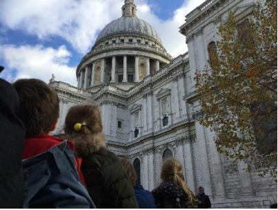
We also went on a walk around the area and were able to visit some churches that Christopher Wren designed.