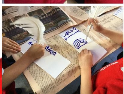
We did different activities like building arches, writing with a quill and ink, and drawing church