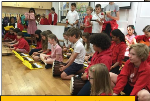
Your class performance of 'Happy' was fabulous – it was great to see every single one of you contributing by both playing instruments and singing! It certainly made us all feel happy!