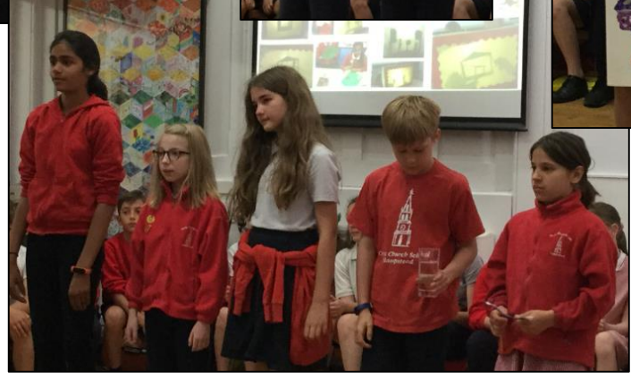
We heard all about your PSHE learning about careers, interviews, CVs and how to challenge gender stereotypes for different types of jobs.