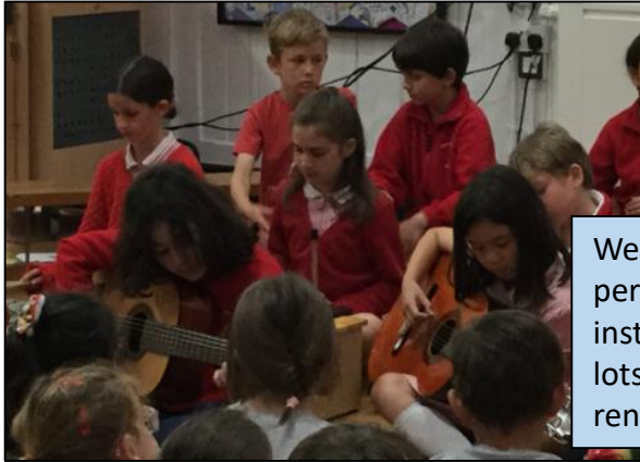
We loved your two music performances – an excellent instrumental performance with lots of solos and a super rendition of 'Electrical Power!'

Thank you for presenting such a professional assembly full of creativity and interesting facts!