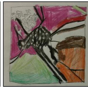
We taught us all how to use view finders to select and draw a small area of a larger landscape or image. We also heard all about how you are practising different stitches in preparation for making money containers in DT.