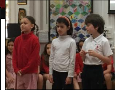
You taught us all about your weather data analysis in Geography, your learning about Brahma in RE and lots and lots of Science, including your electricity, digestive system and tooth enamel enquiries. You have been very busy!