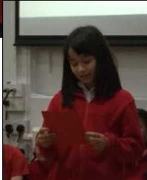
You shared some excellent writing: setting descriptions inspired by 'The Lion and the Unicorn' and some fun animal syllabic poetry.

English Syllabic poetry VEGETARIAN HIPPOPOTAMUS EVALUATING POTATO-SALAD