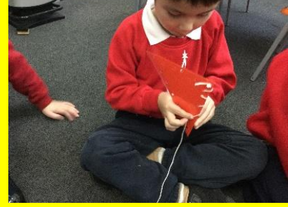
Next we practised our sewing skills