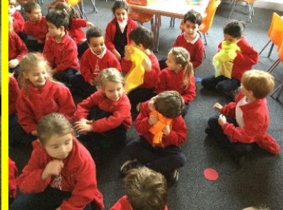
We looked at different fabrics, then thought about whether they would be good for puppets or not, and voted on them. Felt won the vote.