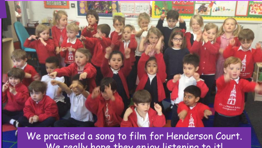
We practised a song to film for Henderson Court. We really hope they enjoy listening to it!