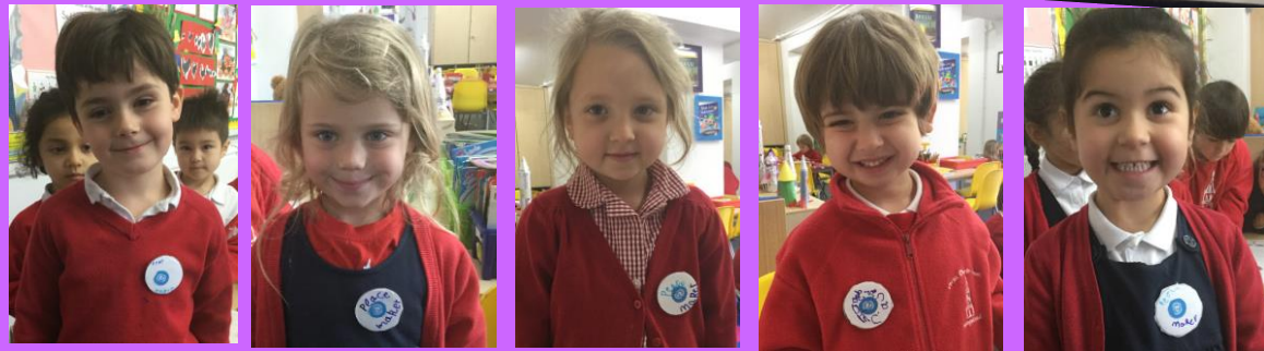
We learnt about the UN Peace Keepers and thought about how we could promote peace in our school. We made peace maker badges and wrote a peace pledge.