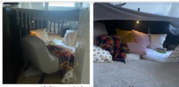
My article 31 den!!

Some of us chose to follow an art tutorial and draw different pictures.