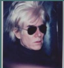
ANDY WARHOL EXPERIMENTED BY WEARING DIFFERENT CLOTHES. HIS STYLE WAS TO WEAR SUNGLASSES AND A BLACK LEATHER JACKET.

Who is Andy Warhol? Andy is an America Artist film director and a producer who is leading figure in visual art movement known as pop art! He was born on 9th of August, 1928 in Pittsburgh, Pennsylvania in the United State. You can view his art in the Museum of Modern art, San Francisco Museum of Modern art and more! The types of art he makes are Pop art, Abstract expressionism, Modern art and more! The movies that he has taken part in is Chelsea girls, Empire, Blow Job and few more as he well known for a film director and an artist! He attended a few art school for a few years. Until today his art is still seen as is quite popular around the world as he created lots of amazing pieces of work that got quite famous and is in a few Museums!