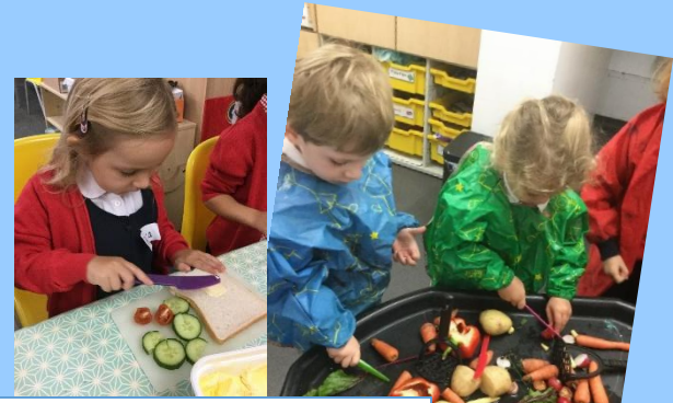
We have been practising our cutting and baking skills!