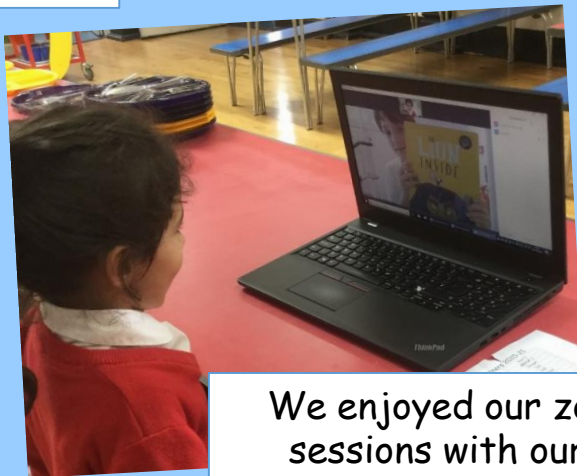
We enjoyed our zoom calls and story sessions with our Year 6 partners!