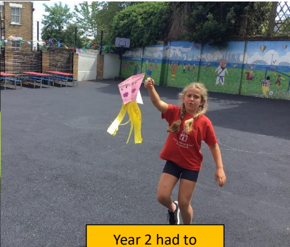
Year 2 had to make kites so we all decided to make one! We had fun trying to fly them in the playground!