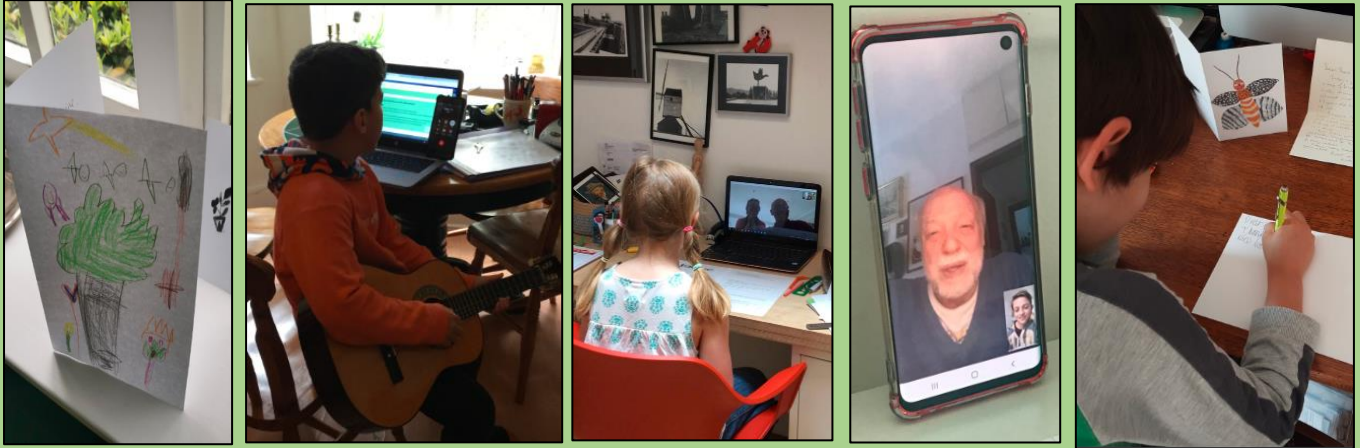
Cards for friends and family, singing and chatting with grandparents

Thank you for telling me about all the acts of compassion you have been showing to your grandparents or to others who might be on their own at this time. I have heard about lots and lots of cards and emails sent to grandmas and grandpas, and lots of people helping out their neighbours who are on their own.