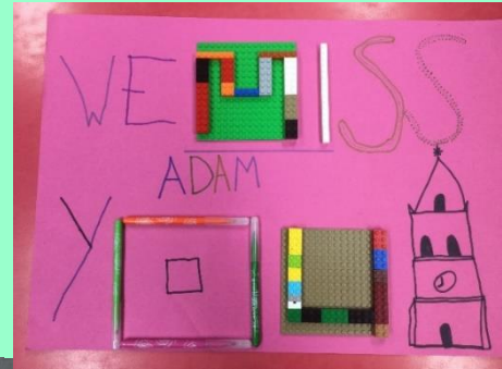
Year 4 created posters