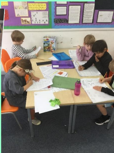
Year 1 and Year 2 hard at work.