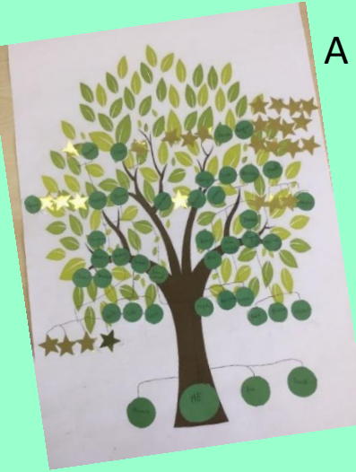
A family tree.

School group – Week 5 Week beginning 4 th May