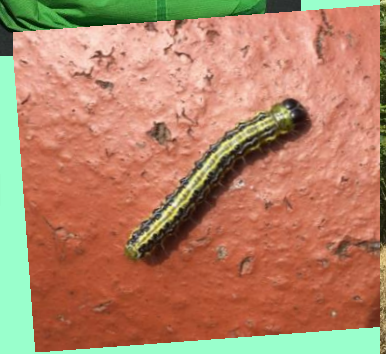
Caterpillar and flowers at school in the sunshine!