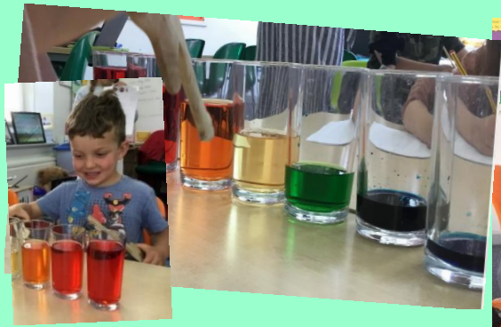
A xylophone made with glasses and different levels of coloured water!