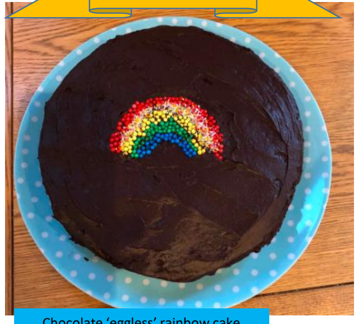
Chocolate 'eggless' rainbow cake baked by Mrs Connock