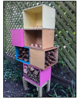
Our new bug hotel!